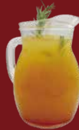
Sunrise Pineapple $22