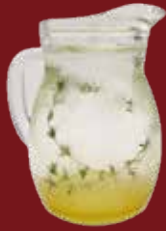
Tropical & Lychee $22