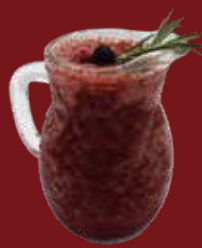
Berry Cocktail Soju $27