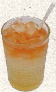
Lemon Lime Bitters