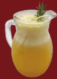
Peach Cocktail Soju $22