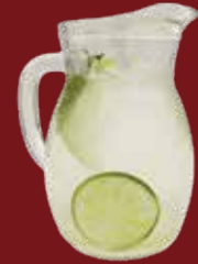
Apple & Lime $22