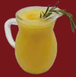
Mango Pineapple Cocktail Soju $27