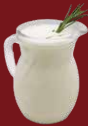
Yogurt Cocktail Soju $27