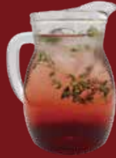
Mixed Berry $22